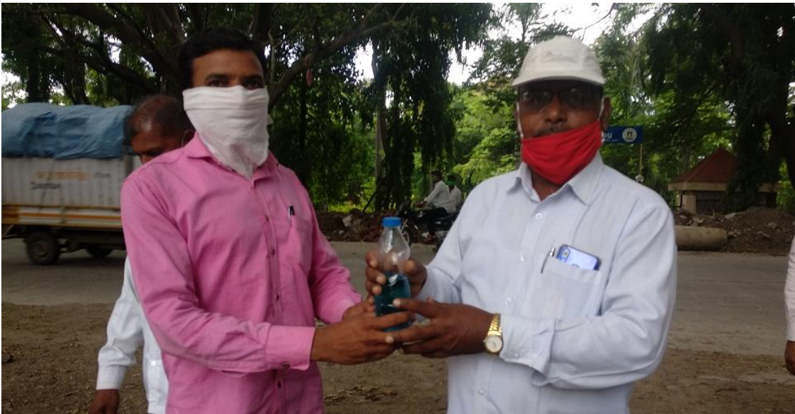
Sanitizer distribution during covid-19 pandemic by faculty.

Also our NSS volunteers were asked to distribute sanitizer near their home town following all the covid guidelines with the due permission of the local authority under the guidance of Principal, Vice Principal and NSS Program officer.