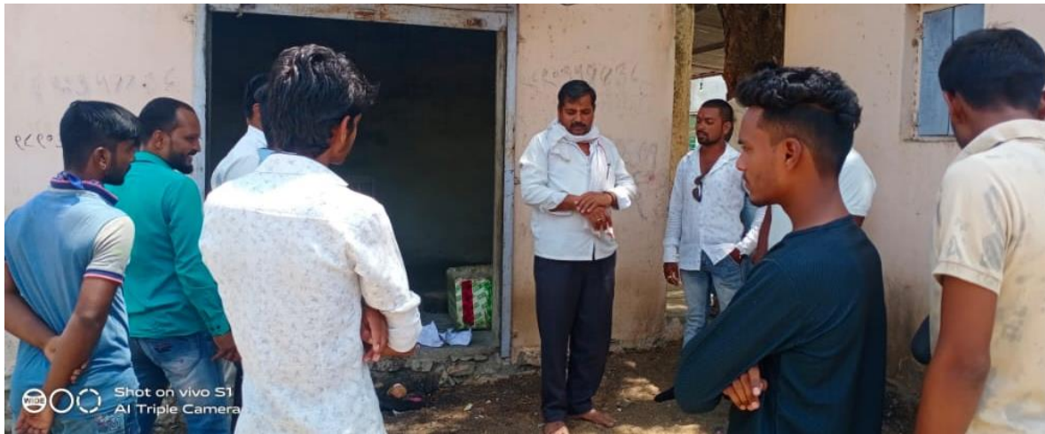
NSS Volunteer and staff helping at Ration during Covid Pandemic.

As per the call given by National Social Scheme department of SPPU Pune NSS volunteers of mula education society's college of pharmacy sonai, helped for ration distribution during covid 19 pandemic.