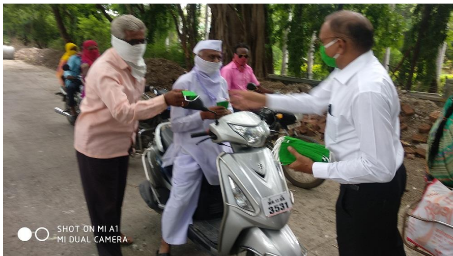
Mask Distribution during covid-19 pandemic by Hon. Principal MES's COP, Sonai.