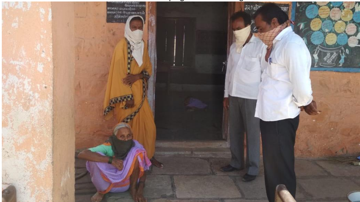
NSS Volunteer and staff helping at Ration during Covid Pandemic.