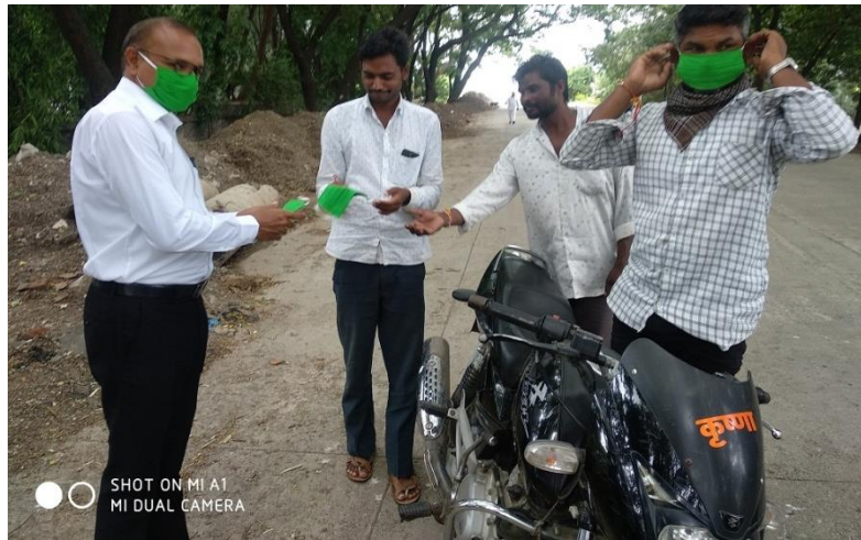
Mask Distribution during covid-19 pandemic by Hon. Principal MES's COP, Sonai.

Also our NSS volunteers were asked to distribute Masks near their home town following all the covid guidelines with the due permission of the local authority under the guidance of Principal, Vice Principal and NSS Program officer.